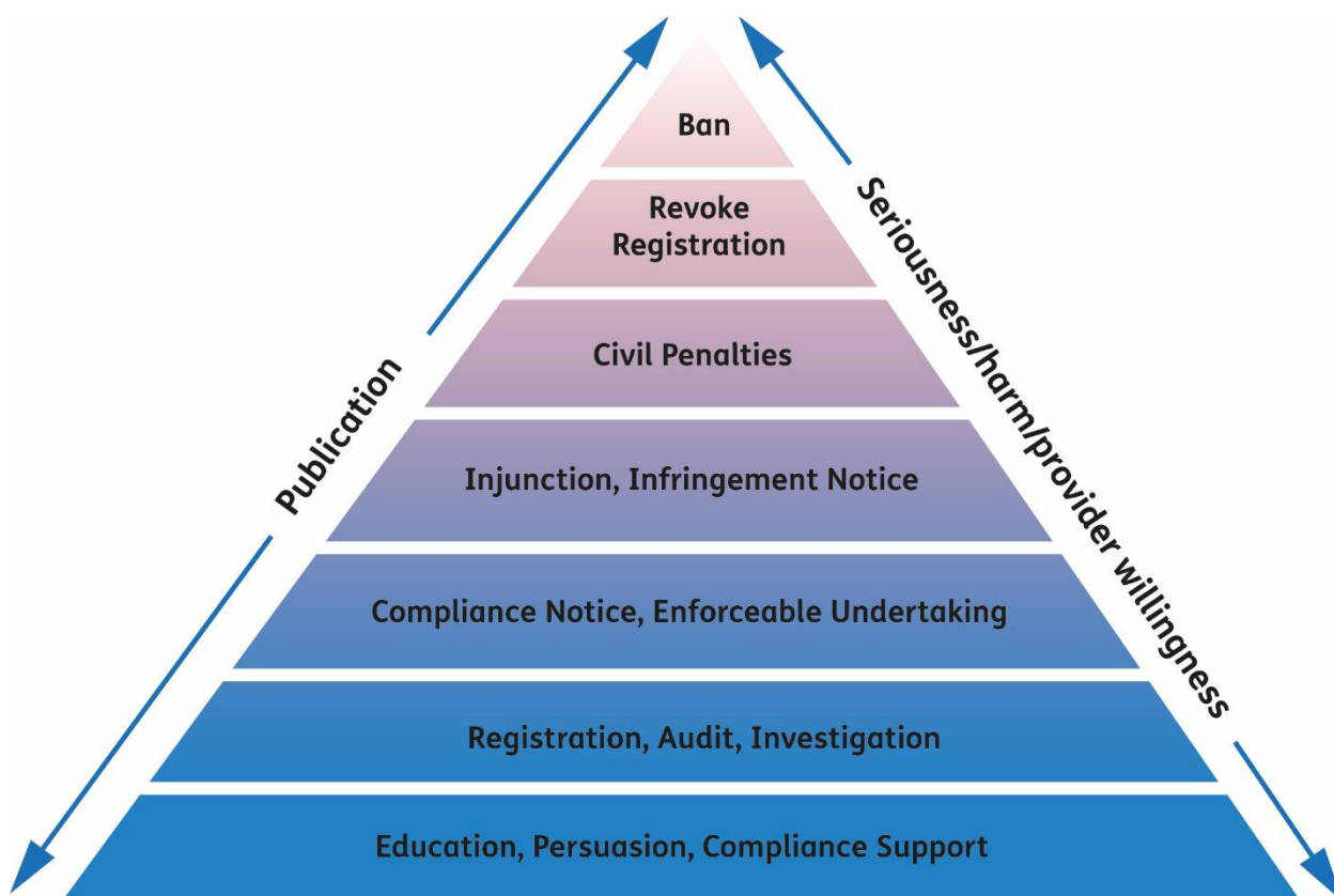
Figure 1: Compliance Pyramid

The pyramid helps to show how the NDIS Commission takes a responsive and proportionate approach to regulation, applying the strongest actions to the most serious issues and breaches. It also demonstrates the ability to escalate actions if an initial response does not achieve the intended outcome.