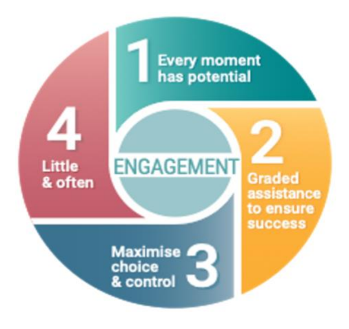
Figure 2. Four essentials of Active Support

The most recent versions of the Active Support training materials reduced the emphasis on paper-based activity or opportunity plans to avoid the focus shifting from practice to paperwork and box ticking, which had been observed as a tendency in some services. Training developed by the Tizard centre translates the theories that underpin Active Support into 'the four essentials' of practice taught to frontline staff (Beadle-Brown, Murphy, & Bradshaw, 2017) and Australian training follows a similar approach (<a href="https://www.activesupportresource.net.au">https://www.activesupportresource.net.au</a>). The four essentials of Active Support are represented in Figure 2.